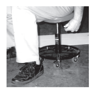
Diagram I, Lowering Seat